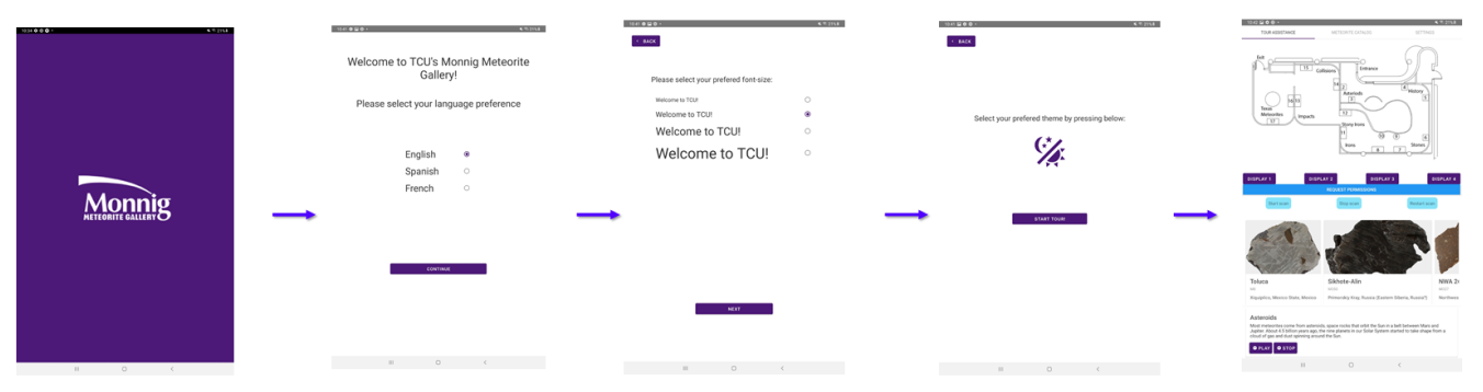
Select preferred language, font, and theme for the best clarity.